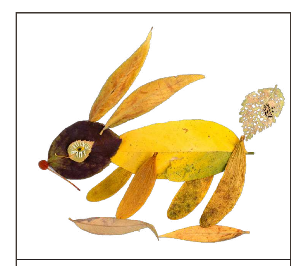
Can you recreate this animal?