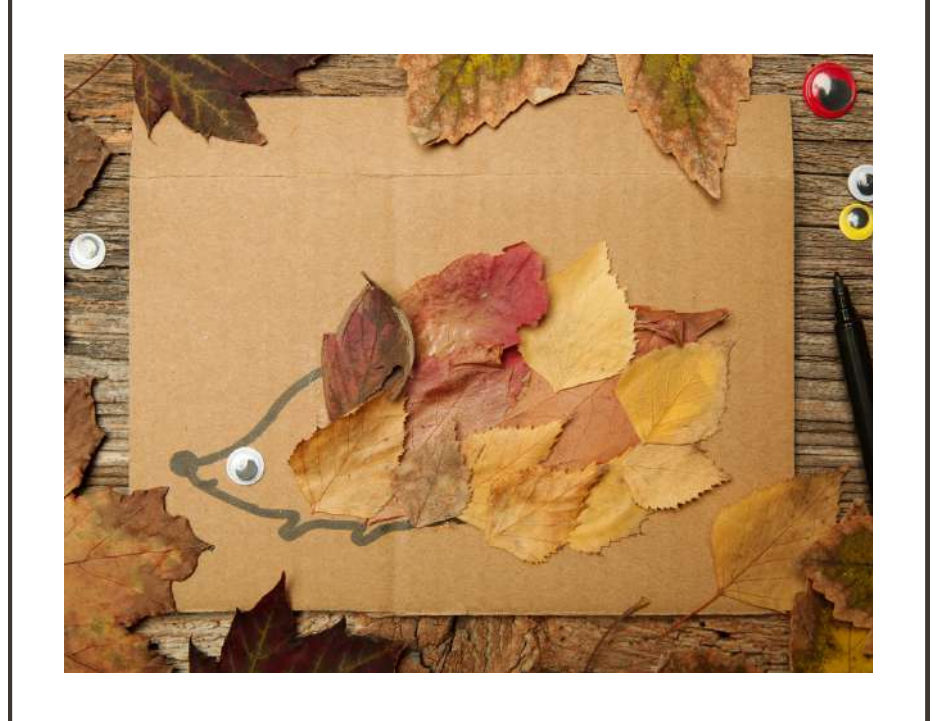
Can you recreate this animal?