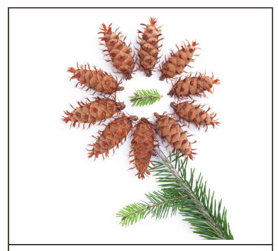
Can you recreate this flower?