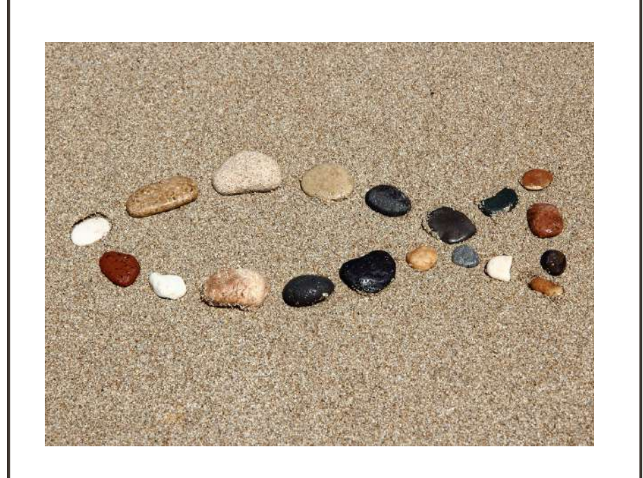
Can you recreate this pattern?