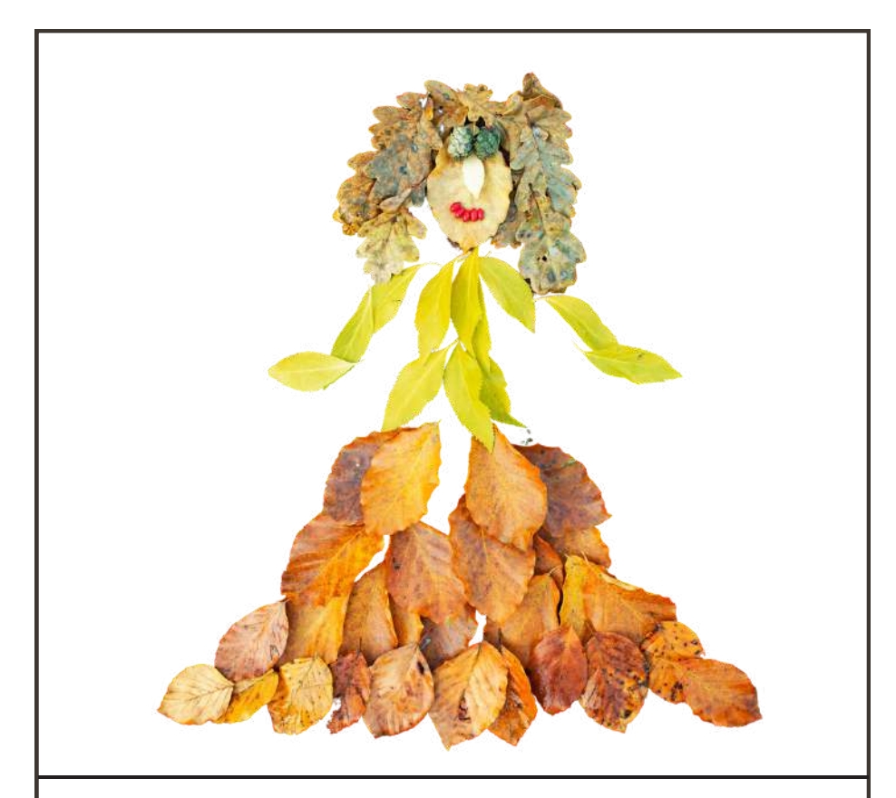
Can you recreate this girl?