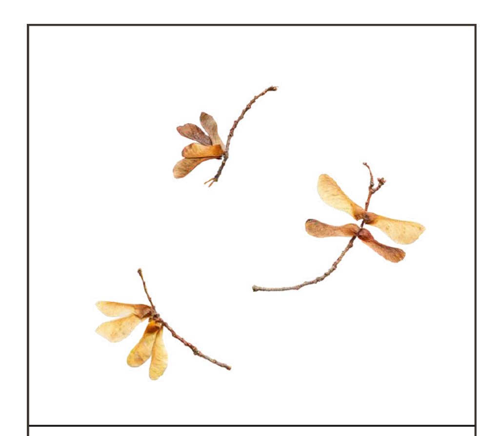
Can you recreate this animal?