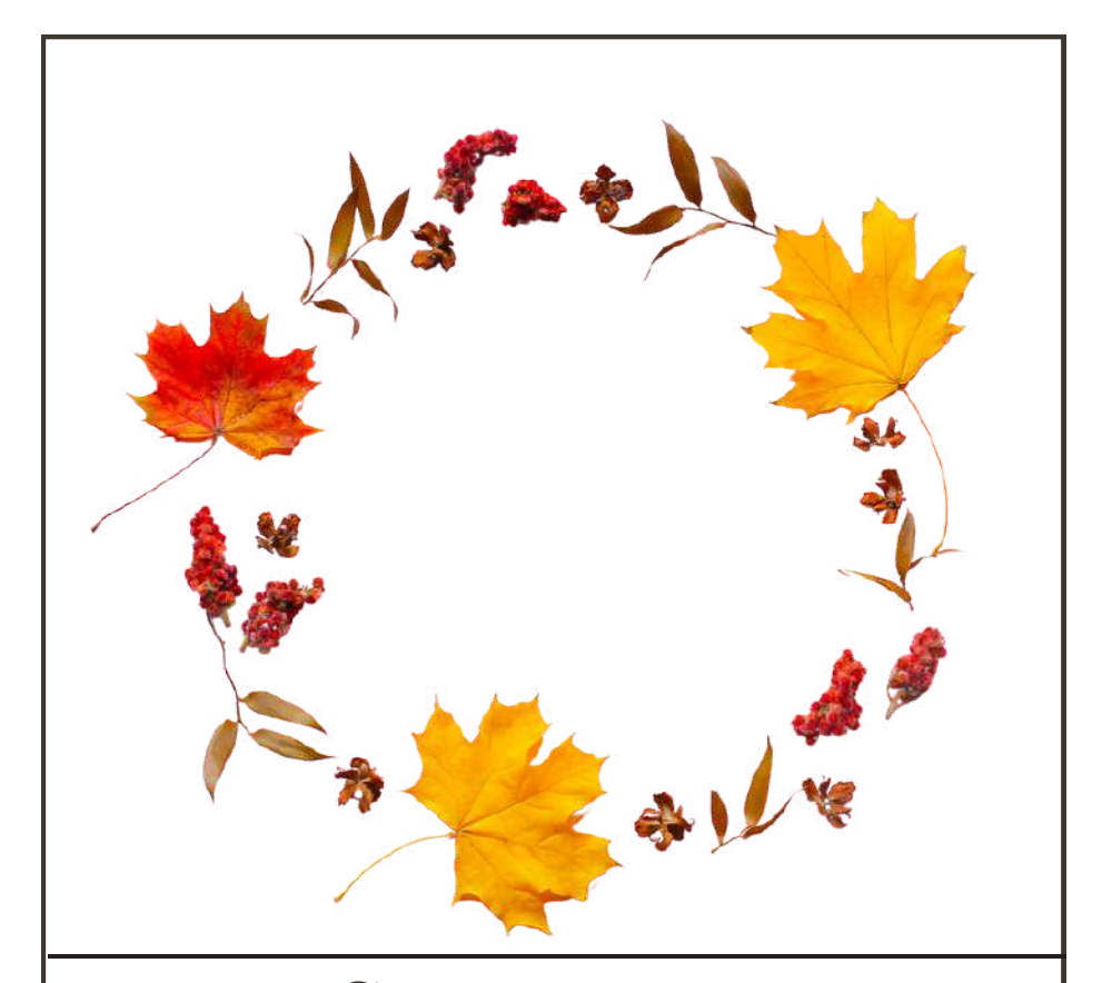
Can you recreate this pattern?