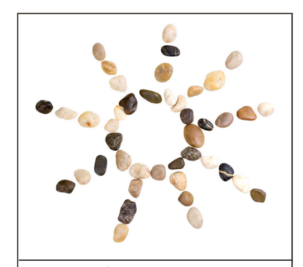
Can you recreate this pattern?