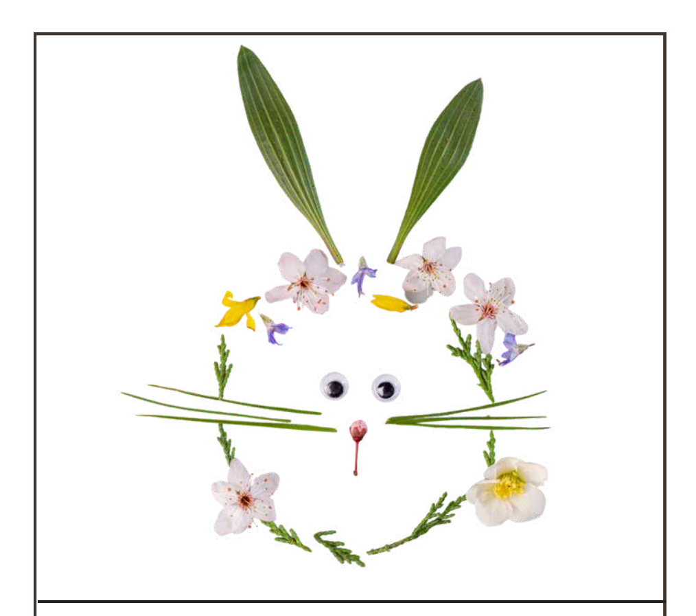
Can you recreate this animal?