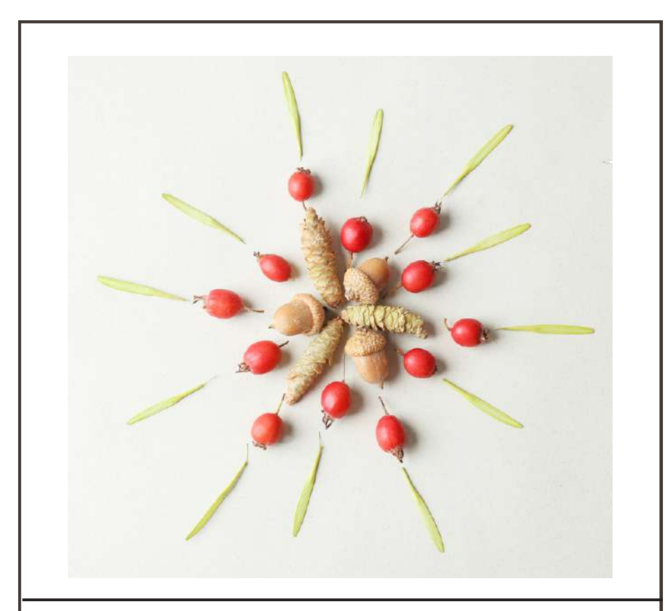
Can you recreate this pattern?