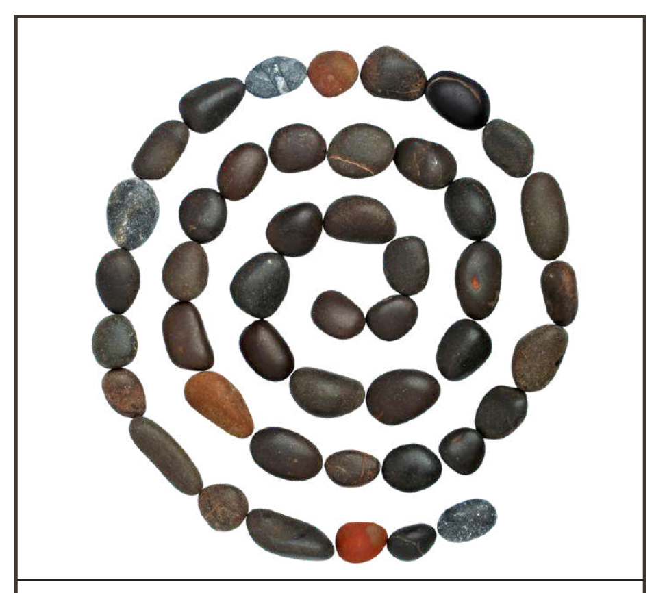
Can you recreate this pattern?