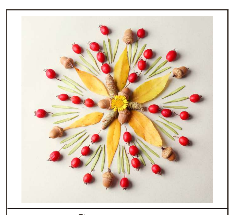
Can you recreate this pattern?