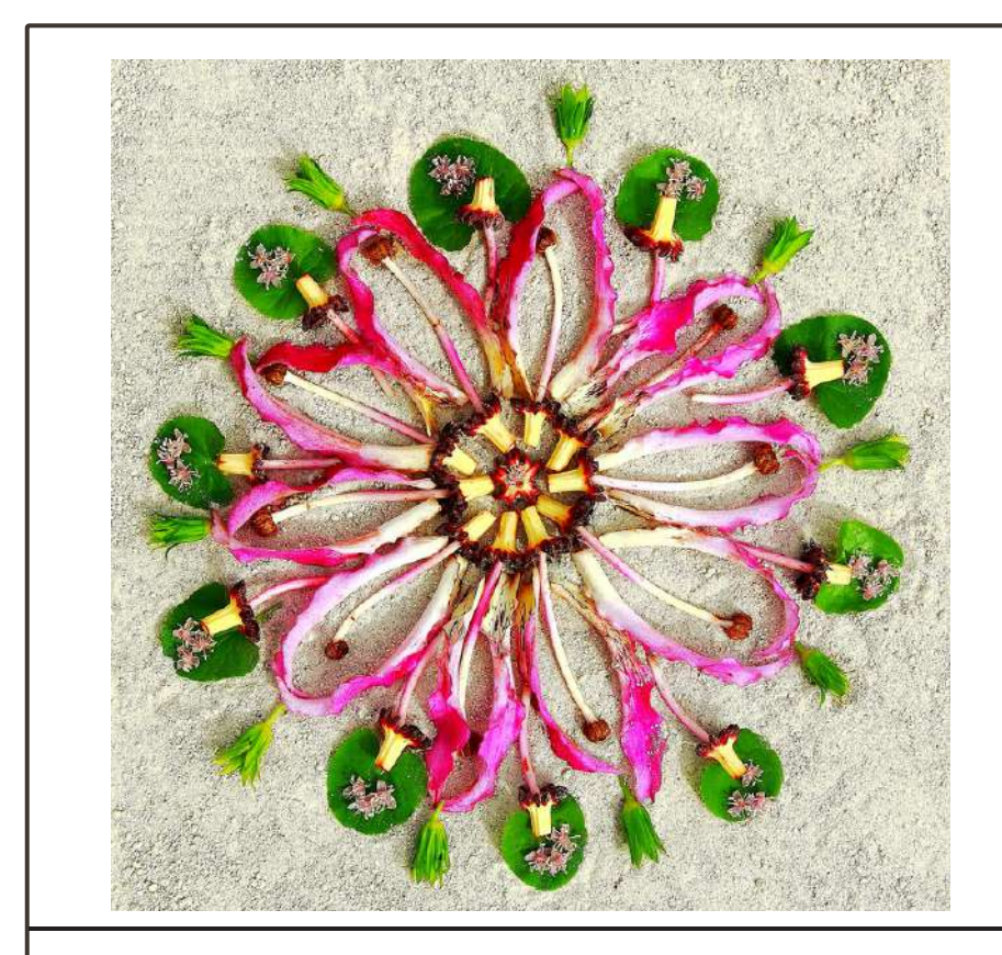
Can you recreate this pattern?