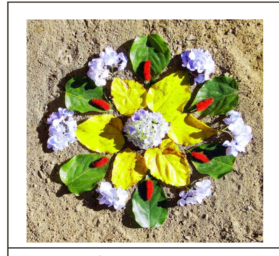
Can you recreate this pattern?