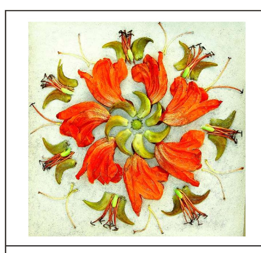
Can you recreate this pattern?