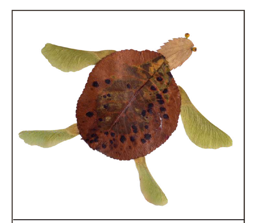
Can you recreate this animal?