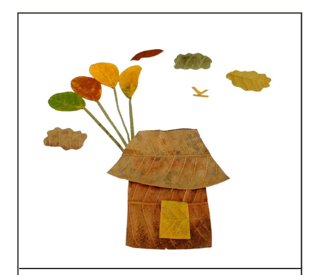
Can you recreate this house?