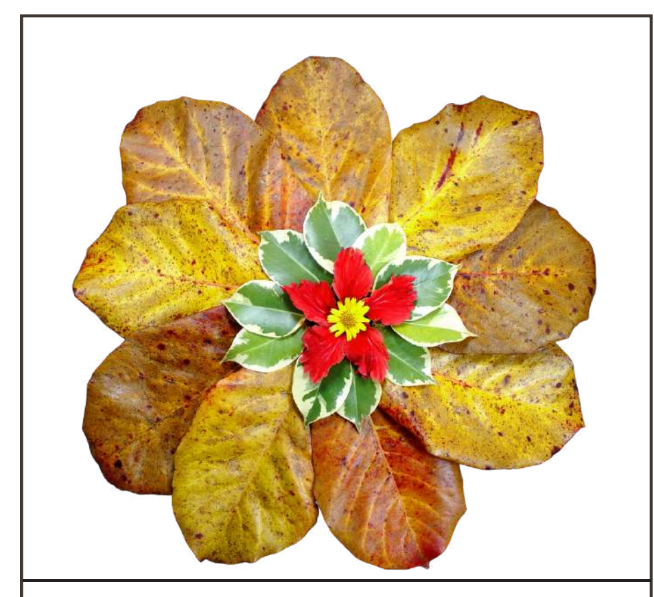
Can you recreate this pattern?