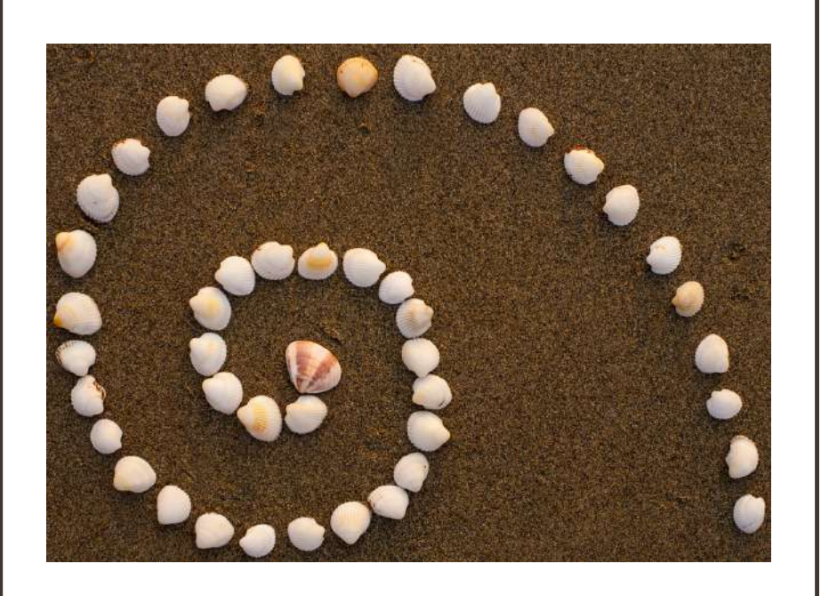
Can you recreate this pattern?