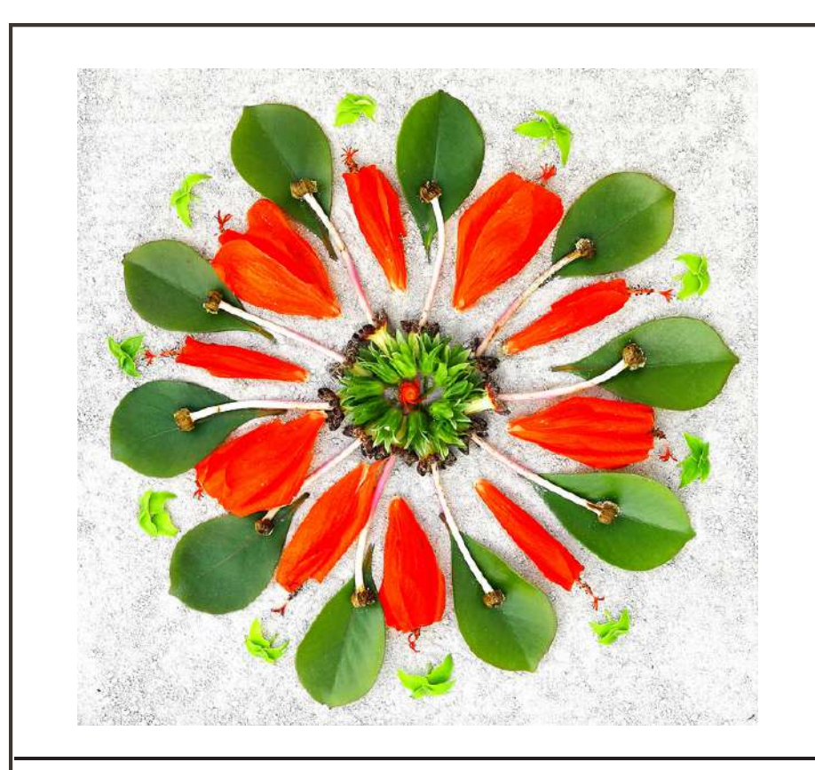
Can you recreate this pattern?