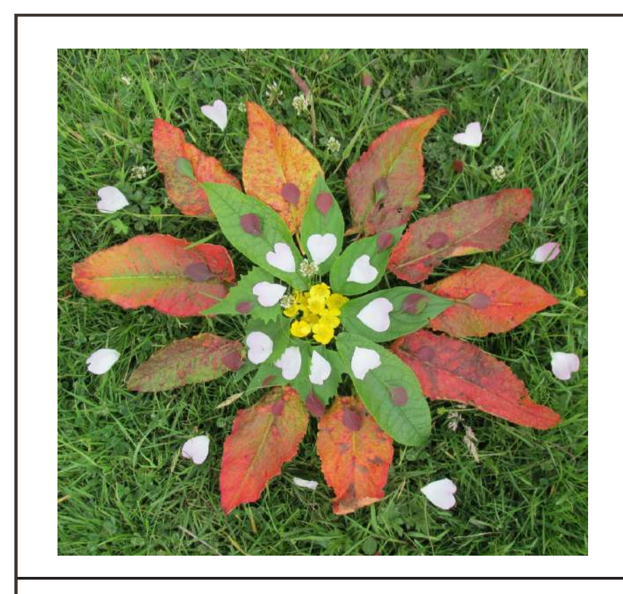
Can you recreate this pattern?