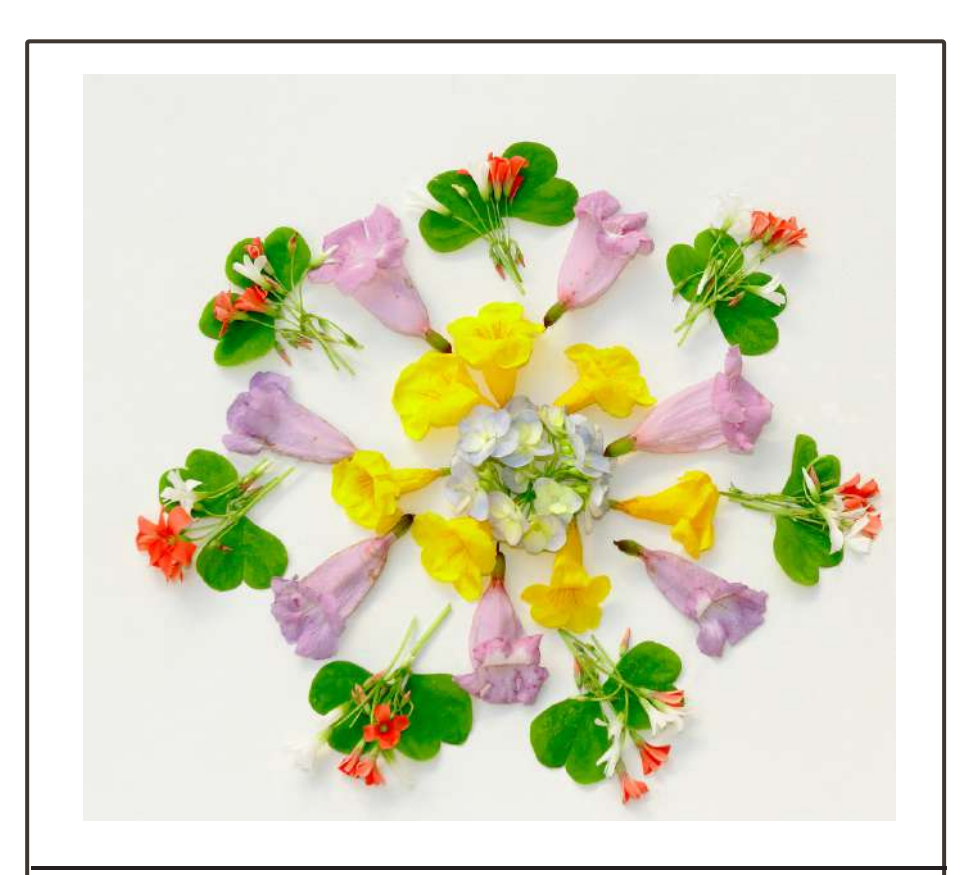
Can you recreate this pattern?