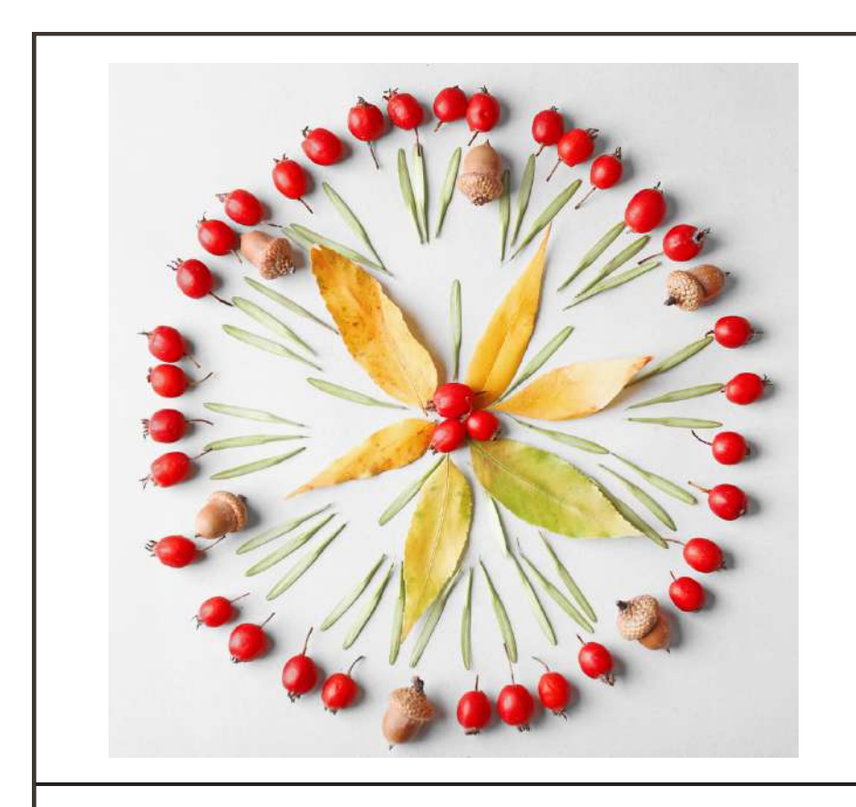
Can you recreate this pattern?