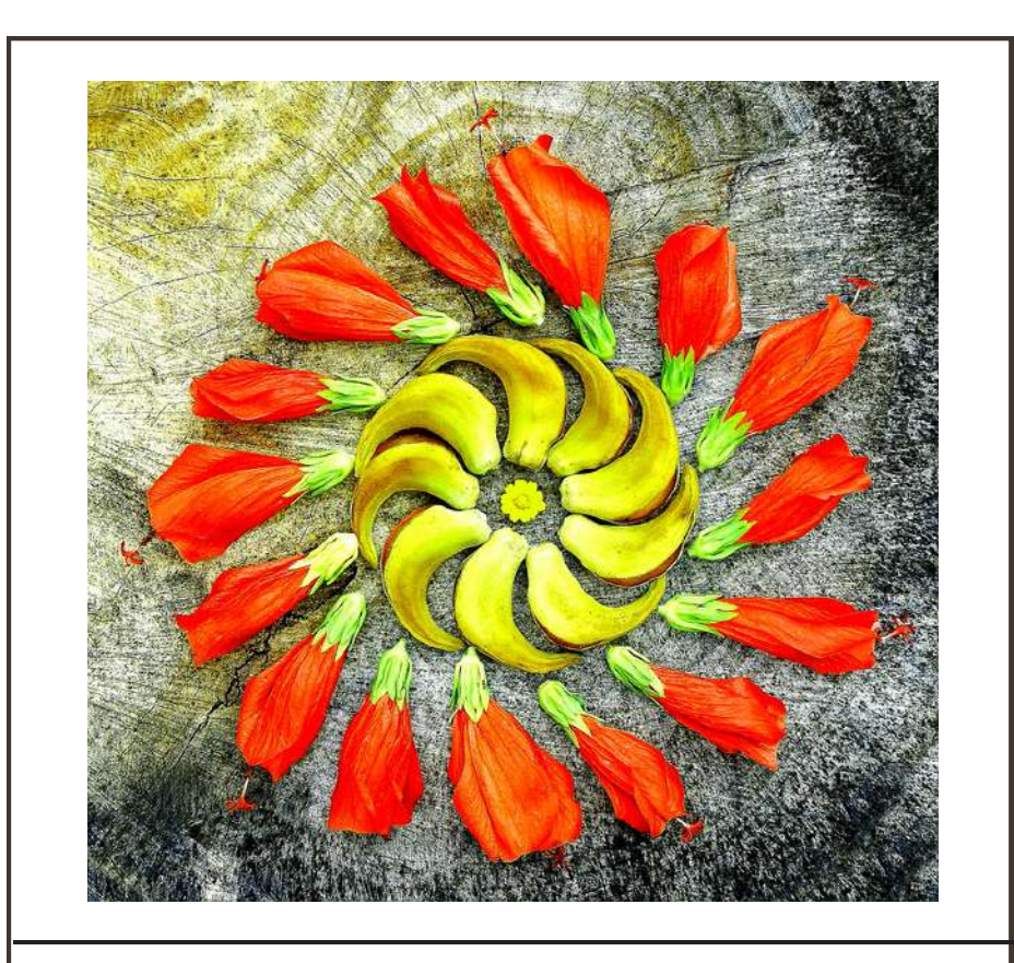
Can you recreate this pattern?