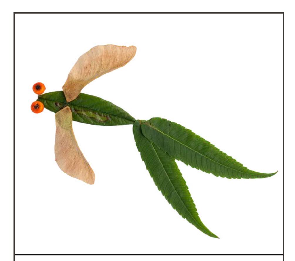
Can you recreate this animal?