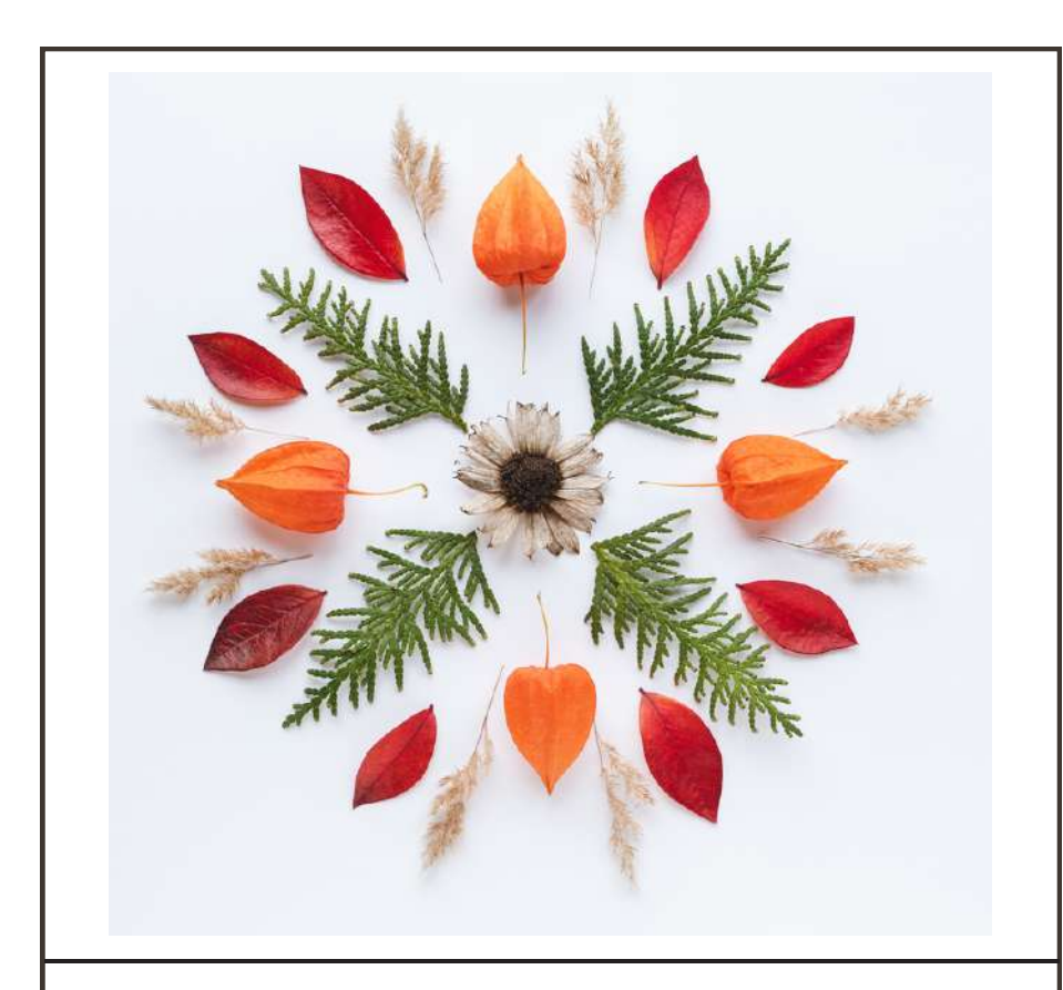
Can you recreate this pattern?