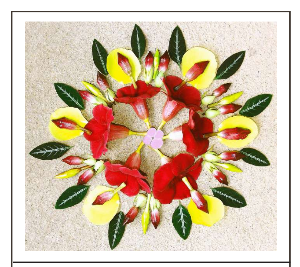
Can you recreate this pattern?